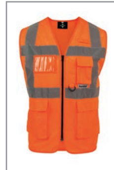
KXEXQO Orange (Front) S - 7XL