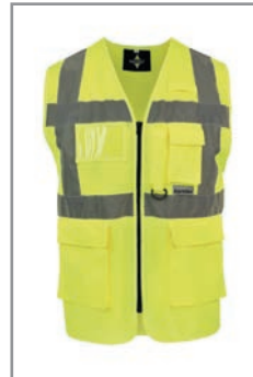
KXEXQG Yellow (Front) S - 7XL

Industry, transport and logistics, construction, authorities, airports