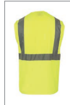
KXEXQG Yellow (Back) S - 7XL