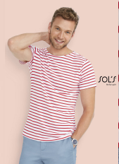
MILES MEN 01398