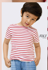
MILES KIDS 01400