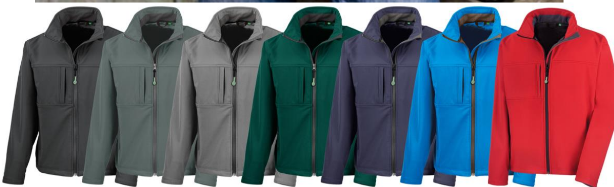
R121M MENS RECYCLED CLASSIC 3-LAYER SOFTSHELL