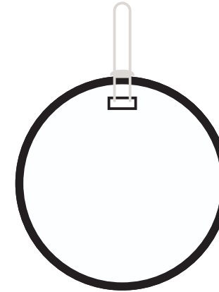
WHITE BACK ROUND SHAPE