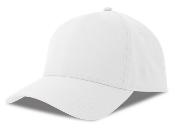
Suitable for print Designed with a printable front panel, making it perfect for customization and branding.

Internal visor made of 100% recycled plastic (PE), made in partnership with ReTraze®. Starting with the 2024 productions.